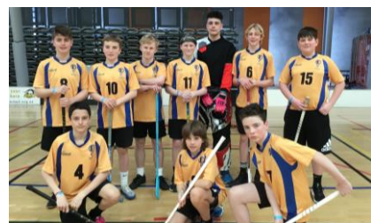
Champion Junior Floorball Team

Over the weekend both our Senior and Junior teams competed in the Floorball Nationals held at ASB. Unfortunately the seniors went down 0-1 in the last 40 seconds of the final. The juniors went back to back winning the final and after reversing their pool play result – congratulations!