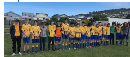
2 nd XI Champions

Four of our eight Football teams played the finals in their grade on Saturday 19 September – the 2 nd XI, 3 rd XI, 4 th XI and Junior Black. Congratulations to the 2 nd XI and 3 rd XI for winning their respective competitions.