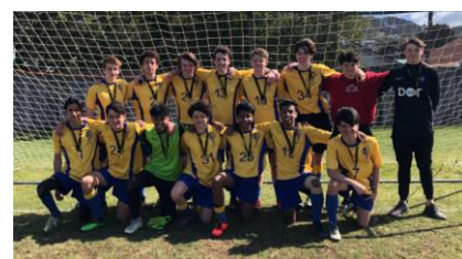
4 th XI Champions