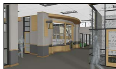
What the Administration Centre will look like on completion.