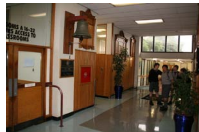
December – before alterations commenced

As you can see from the following images, the re-development of our main entrance is continuing. The first stage is on schedule for completion at the end of this term.