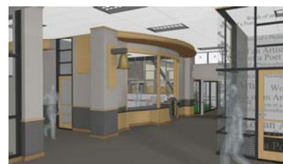
What it will look like when completed