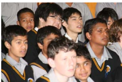
Year 9 students at the powhiri

All parents / caregivers of Year 9 students are invited to the college on the evening of Wednesday 9 March. This evening is held to give you the opportunity to understand our college's structures and systems, so that you can best assist your son in his learning. The evening will begin at 7.30pm in the college's Renner Hall.