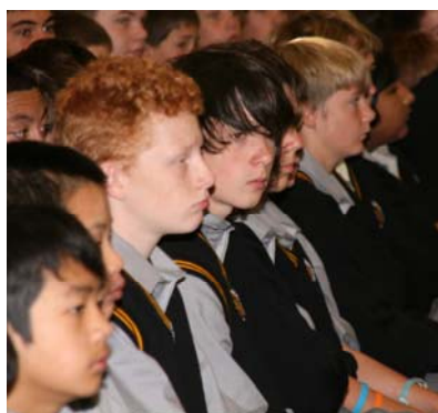
Year 9 students at the powhiri

On Tuesday 1 February we welcomed our new students and staff members with a powhiri in the Renner Hall. Hopefully, this allowed them to feel at home and be part of the Rongotai family from their first day at this school.